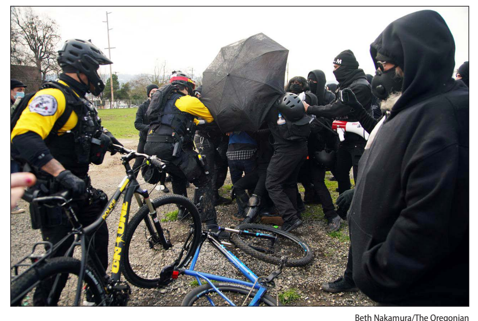
Portland Police square off with demonstrators at Revolution Hall before backing off during a protest Wednesday.

Within minutes, a disorganized scrum formed and about two dozen people