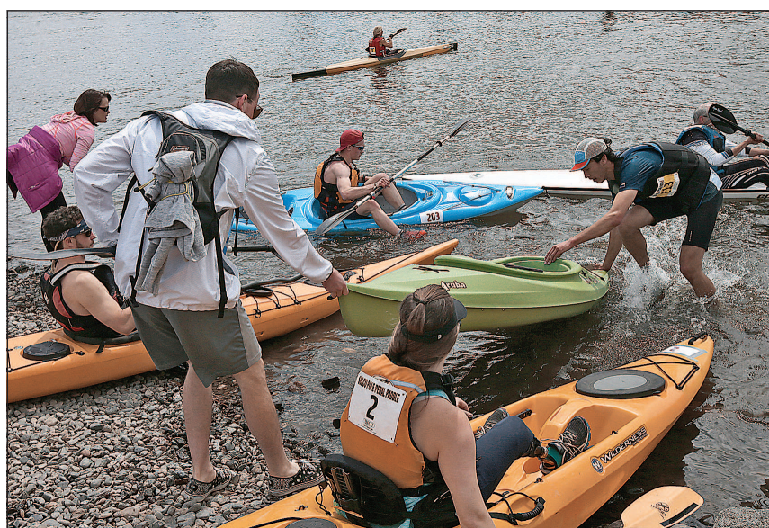
Participants scramble to quickly get in their boats while competing in the 43rd annual Pole Pedal Paddle in May 2019.

The PPP includes teams, pairs and individuals racing in alpine skiing, nordic skiing, road cycling, running, paddling and sprinting along a course from Mount Bachelor to Bend. The event has drawn more than 3,000 participants some years — more than half of whom come from outside Central Oregon — and hundreds more spectators.