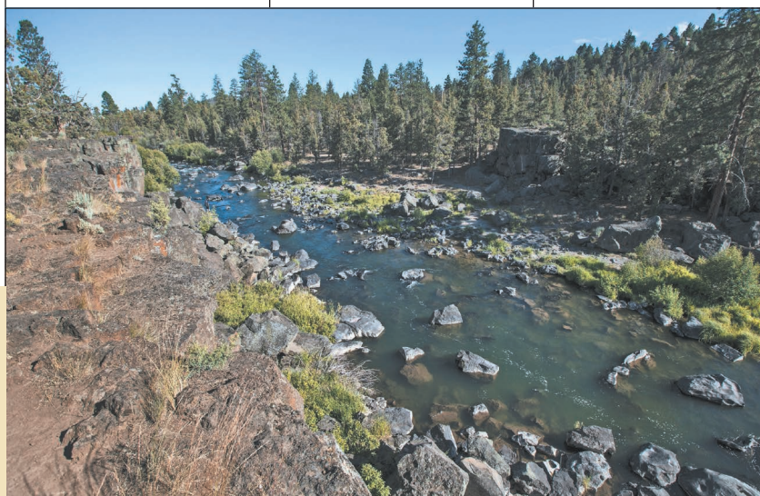
A section of the Deschutes River flows through a rocky area at Sawyer Park in Bend.