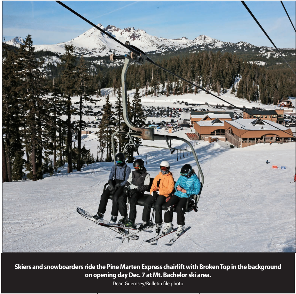
Skiers and snowboarders ride the Pine Marten Express chairlift with Broken Top in the background on opening day Dec. 7 at Mt. Bachelor ski area.