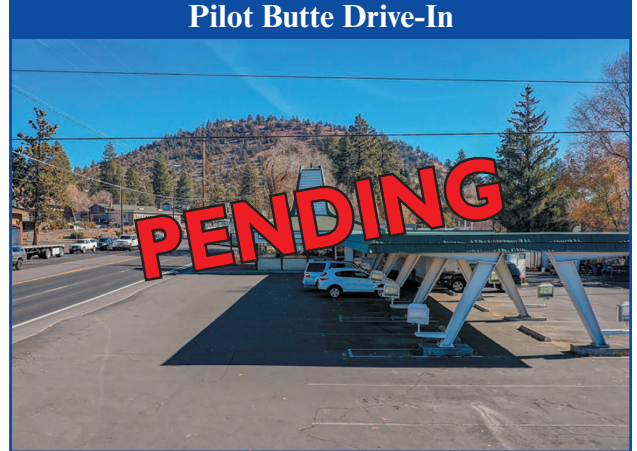
Incredible Location - A great opportunity to buy the 2200+ sq. ft. building on a huge 0.5+ acre!

View ALL MLS Properties on the Market, Pictures & Virtual Tour Movies