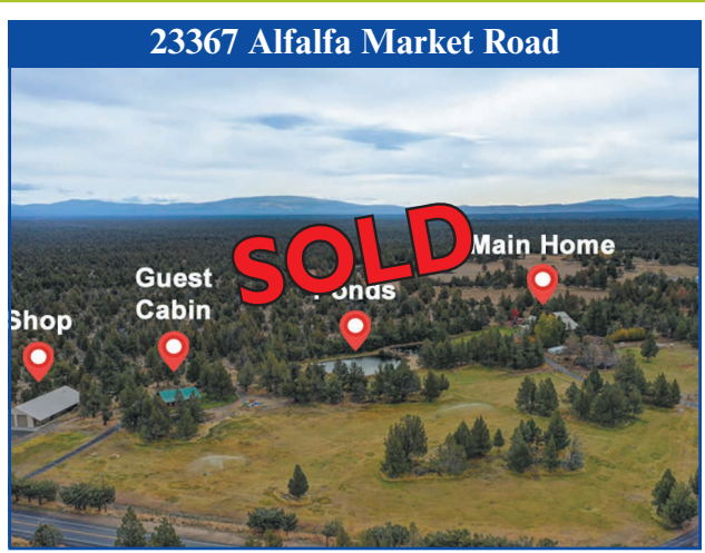
NE Bend, 2 homes, 13+ acres, 4000 sq. ft. shop!