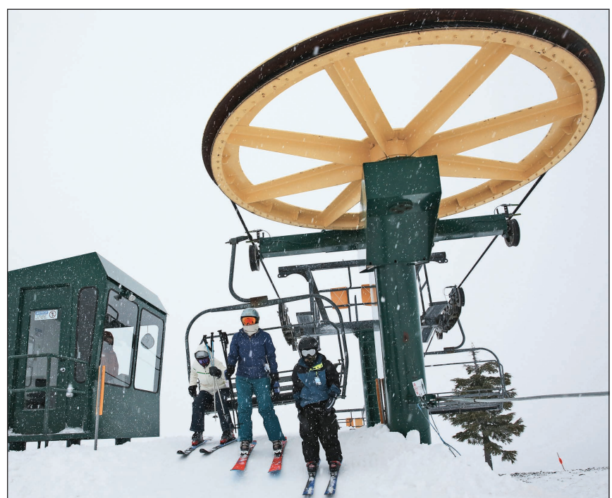
Skiers get off the chairlift at Hoodoo Ski Area.