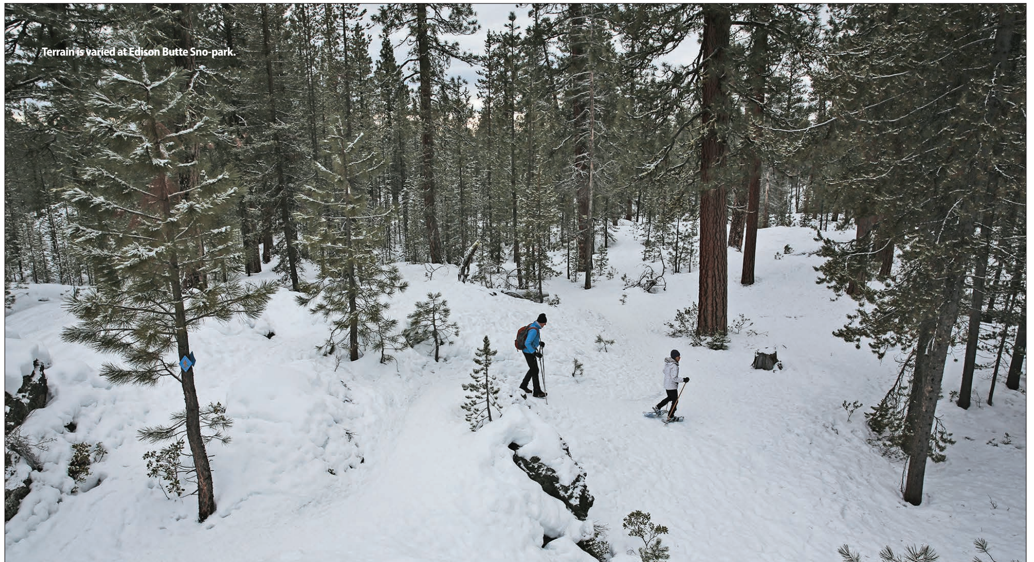
Terrain is varied at Edison Butte Sno-park.