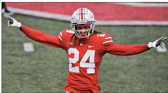
Ohio State defensive back Shaun Wade plays against Indiana in November in Columbus, Ohio. Wade may have a chance to prove his worth to NFL scouts if he has any success in defending Alabama receiver DeVonta Smith in Monday's championship game.