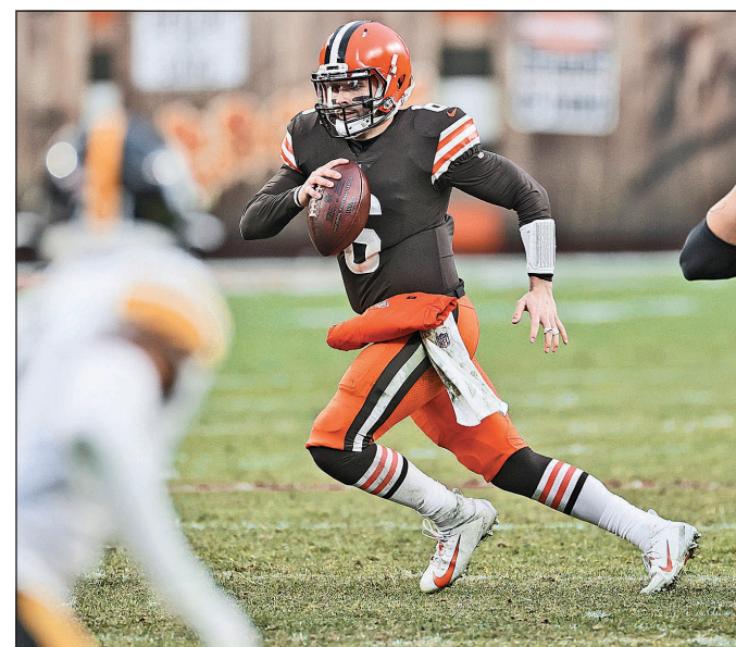
Cleveland Browns quarterback Baker Mayfield (6) scrambles against the Pittsburgh Steelers last Sunday in Cleveland. Mayfield leads the short-handed Browns against the Steelers in the wild-card round. The Browns' last playoff appearance was in 2002.

ing win over Jacksonville. Only Derrick Henry was more productive in that stretch and Taylor finished third on the season with 1,169 yards. The Colts will likely need another big performance to keep pace with the high-powered Bills on Saturday. Chris Godwin and Mike Evans: The two Tampa Bay wideouts have been among the most productive receivers in the league but never managed to make it to the playoffs until Brady arrived in 2020. Evans is the first player to begin his career with at least 1,000 yards receiving in each of his first seven seasons but is nursing a left knee injury that leaves his status in doubt this week. Godwin was slowed a bit by injuries this season but still has 3,015 yards and 23 TDs over the past three seasons.