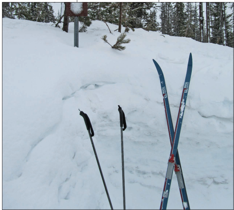
Ray Benson Sno-park offers 18 miles of cross-country ski and snowshoe trails.