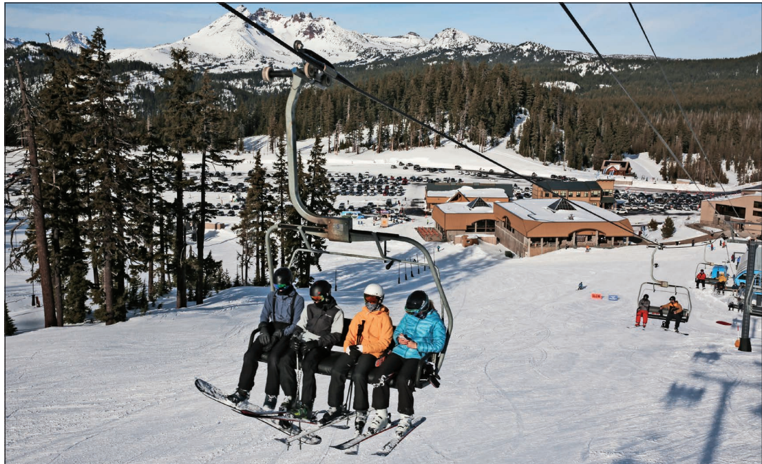
Skiers and snowboarders ride the Pine Marten Express chairlift with Broken Top in the background on opening day Dec. 7 at Mt. Bachelor ski area.

For a full list of conditions updated regularly, please visit centraloregonexplore.com .