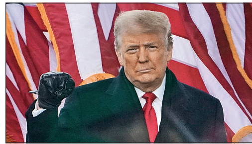
President Donald Trump arrives to speak at a rally in Washington on Wednesday. The gathering eventually devolved into what Sen. Mitt Romney and others characterized as an "insurrection" at the U.S. Capitol.

Democrats win Georgia seats — and control of the Senate, A4