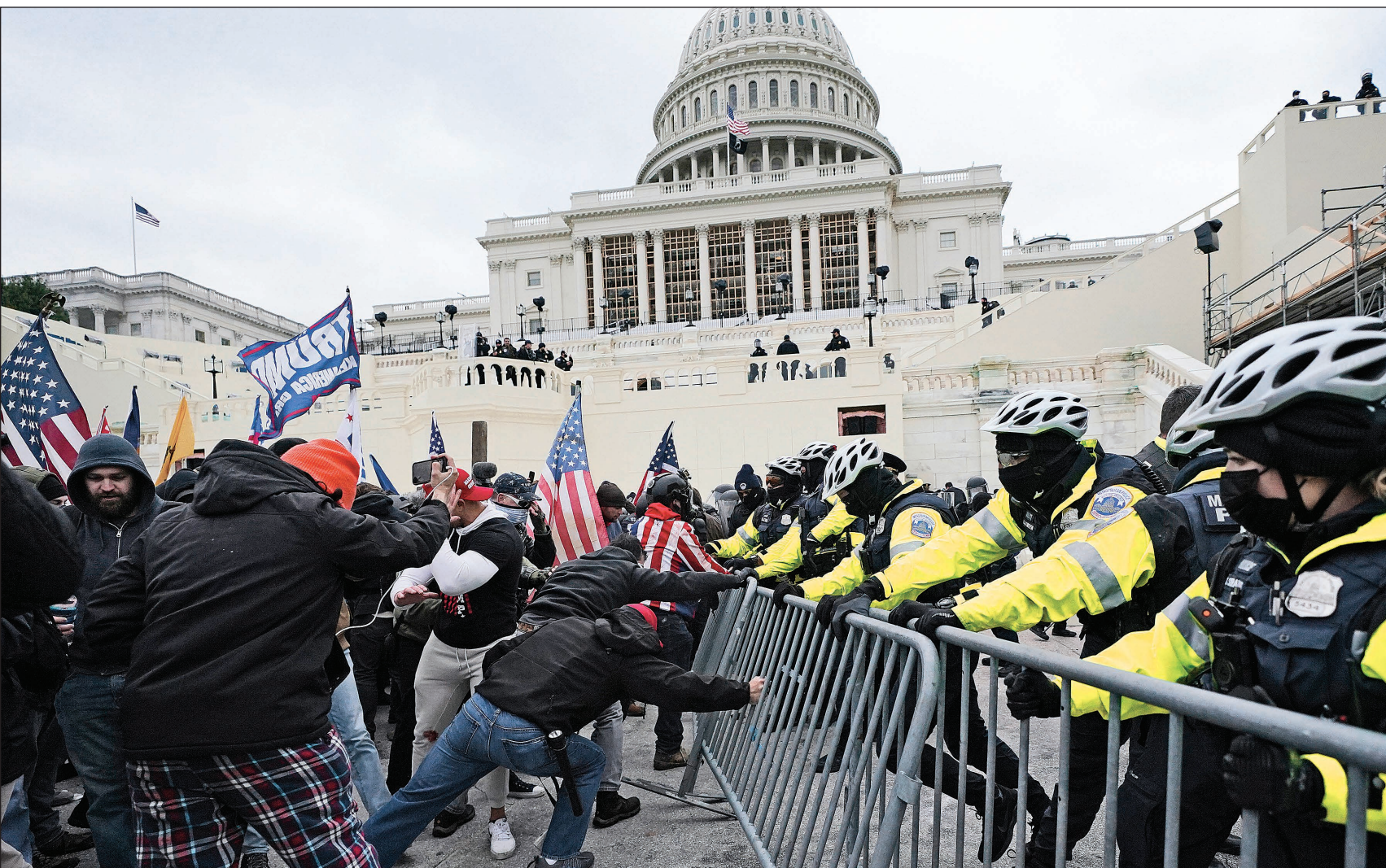
Trump supporters try to break through a police barrier Wednesday at the U.S. Capitol. As Congress prepared to affirm President-elect Joe Biden's victory, thousands of people gathered to show their support for the president and his claims of election fraud.

Local residents express outrage over D.C. chaos