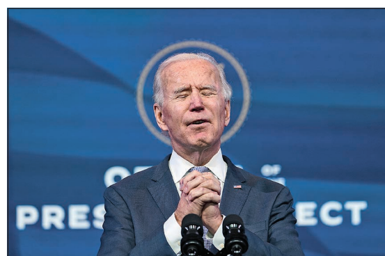
Joe Biden speaks from Wilmington, Delaware, on Wednesday. Biden — due to be sworn in as the next president in two weeks — called the violent protests on the U.S. Capitol "an assault on the most sacred of American undertakings: the doing of the people's business."