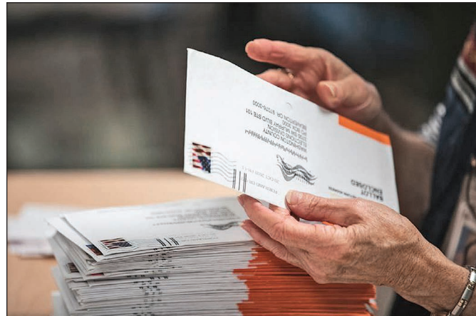
In Oregon, 2.4 million ballots were returned in November's election.