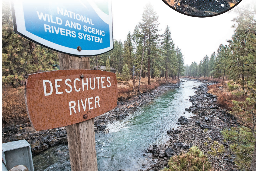
ABOVE: Water flows along the Deschutes River below Wickiup Reservoir in November. INSET: An Oregon spotted frog in 2012 at the Old Mill District in Bend. The species needs better water flow than current rates in the Deschutes River.