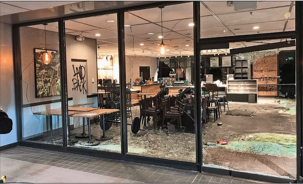
Portland Police Bureau

Portland Police shared a photo of property damage to a Starbucks in Portland on New Year's Eve.