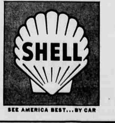
SEE AMERICA BEST... BY CAR