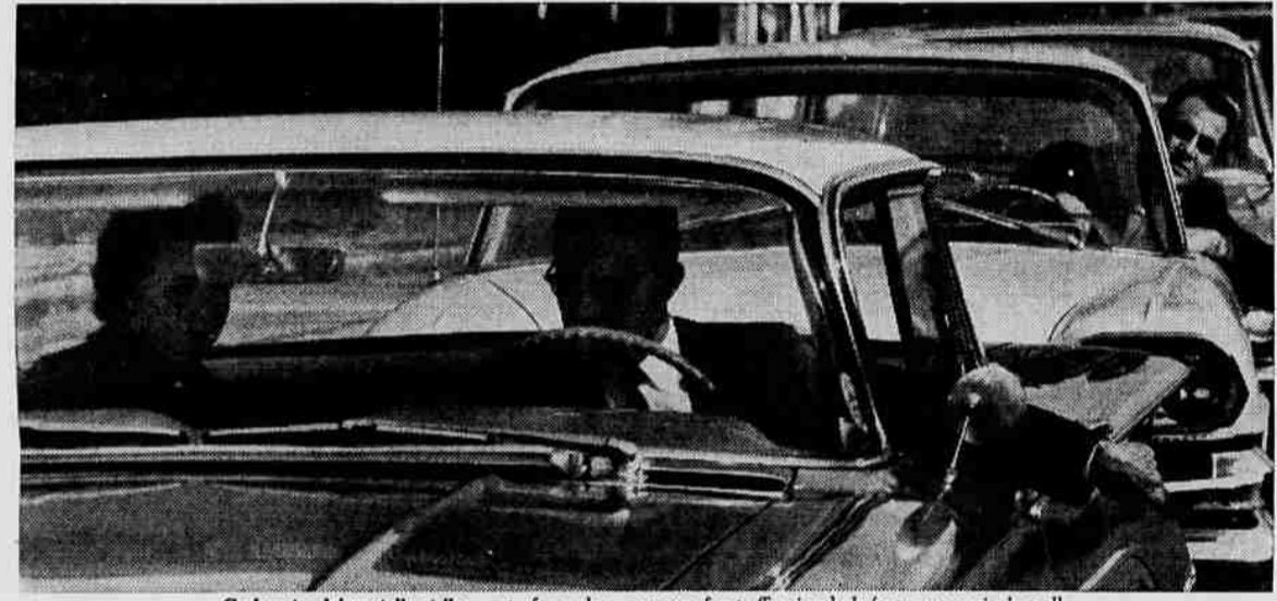
Carburetor icing stalls strike most often when you stop for traffic signals before your engine's really warmed up. Read how Super Shell's anti-icing ingredient works to fight these pesky, embarrassing stalls.

EMBARRASSING STALLS Even at 50 degrees, carburetor icing can stall your engine. Read how one of Super Shell's 9 working ingredients fights these mysterious stalls.