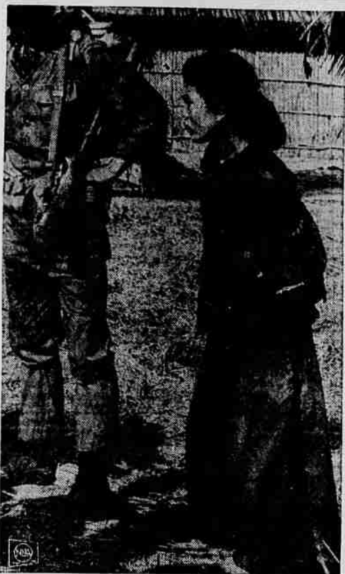
ENEMY — Her hands tied behind her back, a captured 17-year-old Viet Cong girl is guarded by a soldier in Ba Xuyen province in South Viet Nam.