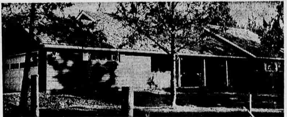
THIS IS THE HOME of Mr. and Mrs. W. L. Scholtes at 1646 East 11th. THIS IS one of the finest homes in the area. Low, ranch-type styling is beneficial to this beautiful home. Features include 5 well-appointed bedrooms, 3 baths, fireplace that serves both living room and separate family room, formal dining room, country kitchen. Plus these quality features: a used brick Wains coating on the front for a modern appeal, split-shake roof, all storm sash and thermopane windows and a maintenance-free siding. This is spaciouly designed with the family in mind. Proof of the versatility of the builder.