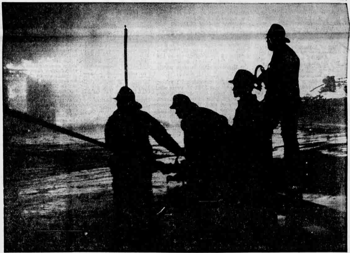
WATCH DESTRUCTION —Firemen, silhouetted against fire-brightened sky, direct hoses on raging cauldron, as water forms lake on school ground. Fire was discovered this morning before 3 o'clock, and was well advanced when fire-fighting operations began moments after its discovery. All volunteers and regular firemen were on the job; crowds gathered as news of the tragedy spread. Workmen passing by to early jobs called homes.