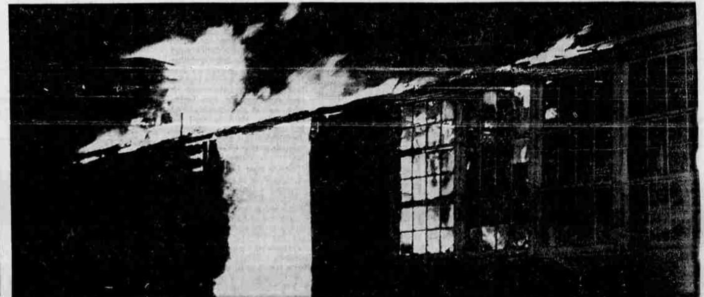
ROARING FURNACE —Flames belch from school's South entrance, as walls on all sides of building are consumed simultaneously. Hundreds saw school reduced to ashes, watching firemen's valiant efforts which were useless except to keep fire from spreading to other buildings. Fourteen-room school was a major institution in Bend school system; loss is around half million dollars. Temporary housing of students is being planned.