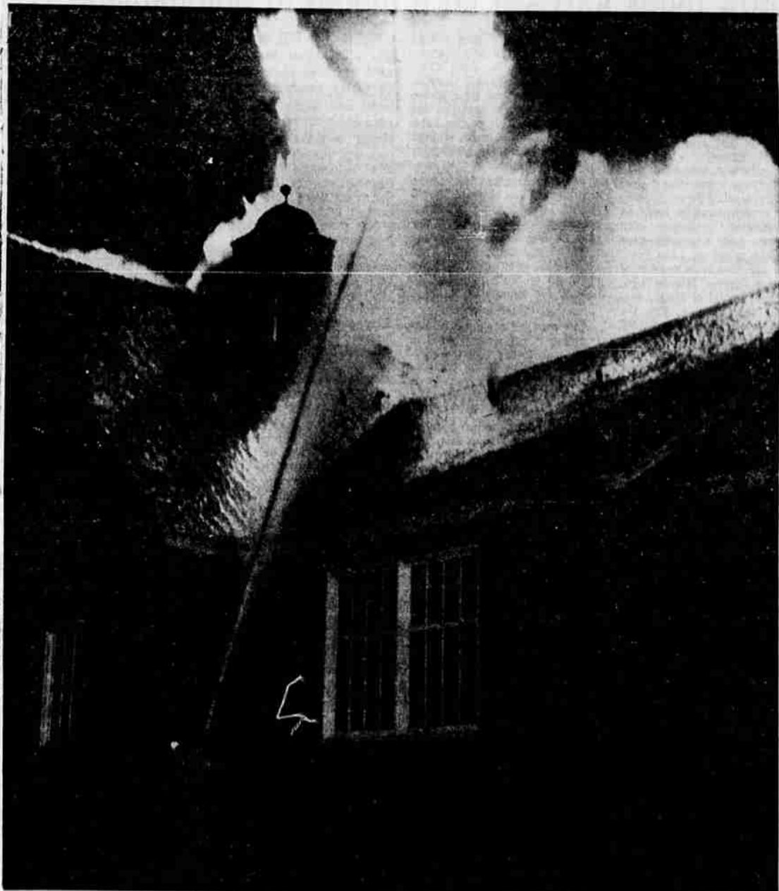
FLAMES COLOR SKY —Fire that razed Allen School was a spectacular display in the early morning hours today. Roof being sprayed with water crashed in, after effort to chop outlets failed. Rockwork at building center, left, stands now in isolation, like Roman ruin. Building was total loss, and remains continued to smoulder throughout the day.