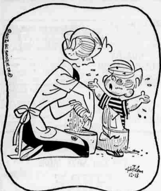
"HE GOT IN A LUCKY PUNCH! HE GOT IN A WHOLE BUNCH OF LUCKY PUNCHES!"