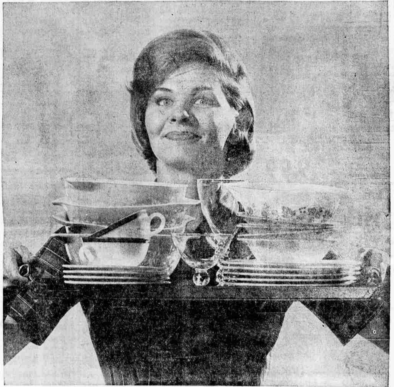
Pacific Powerland housewife, whose husband's name is Joe, confesses: