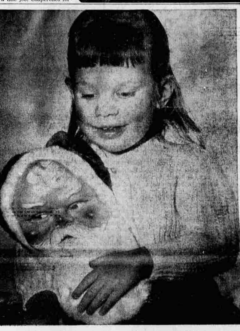
Get this appealing "Santa Sack"

POLLY'S CAFE Opening In Near Future Under New Management 809 Wall - In Downtown Bend