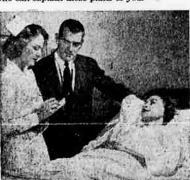
HOSPITAL EXPENSES have been going up at the rate of nearly 1% a month since 1950. An American Republic Plan can help pay se bills when you need money most