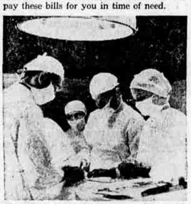
SURGEONS' BILLS, TOO, can wreck a family budget. An American Republic Plan can help pay the costs of operations. Look for the man who can explain these plans to you.