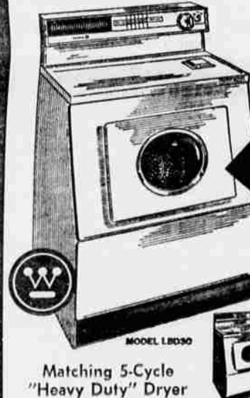
MODEL LBD30 MODEL DRD30

Even Less With Trade-In! Delivery & Service Included