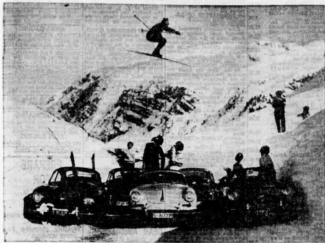
ACTION HIGHLIGHTS NEW SKI FILM —This is the sort of action Skyliner ski fans will see Saturday at 8 p.m. in the Bend High School Auditorium. That is when Warren Miller, world renowned ski-cinematographer, will personally narrate his latest film, "The Sound of Skiing." Here a skier at Zurs, Austria, tempts fate and hopes to reach the far side of the road.