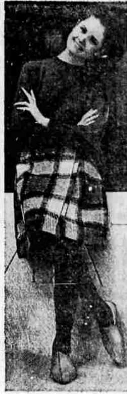
Teaming up with plaid wrap skirt, classic sweater, is diamond-patterned casual stocking.

Slacks are due to enter the fall season with a more moderate point of view, somewhat fuller but still definitely "trim and tapered." Plain-front and single-pleat models will have their special adherents.