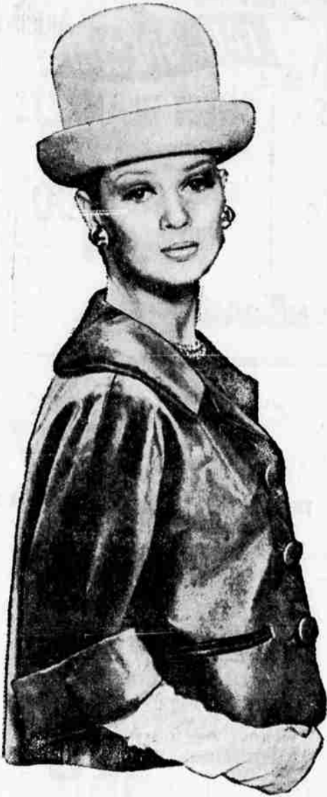
Suggestion of the sportive combined with luxurious elegance appears in a jaunty jacket of natural sheared Alaska fur seal. Leather etches the fine detailing.