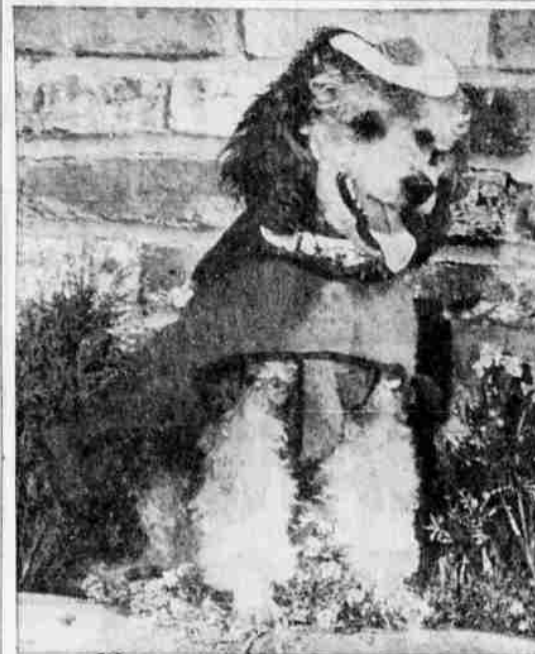
FURS FOR FALL—Just to prove that a dog's world isn't all bad, this proud poodle models one of the latest canine fashions, ready now for Fall Opening here at the Town & Country Pet Shop. It's a nubby nylon coat, fully washable, trimmed with a soft fur collar. And only $3.98. Extravagant? Not at all! Small dogs need extra protection during our chilly mornings and evenings. And here at Bend's fully stocked pet shop you'll find a complete selection of dog coats and sweaters, from $1.95. Come see! We're at the corner of Reed Mkt. & Hunnell Roads. Or call us at 382-1254. Adv.

Fur styles stress shape, whether lean and natural or lightly fitted at front. Capes and cape effects get attention. Sleeves are stand-outs, newly important, long and lovely. For little furs, the shorter sleeve shows up but adds shape-ly width — example, a chinchilla jacket with bubble sleeves.