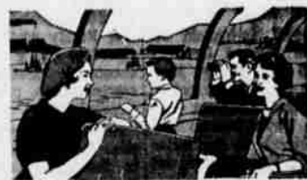
Next trip east take your family along. See the scenery at eye level from the Domesday "City of Portland." Family fares apply to both Pullman and Coach.

UNION PACIFIC RAILROAD For prompt information phone: 382-1901