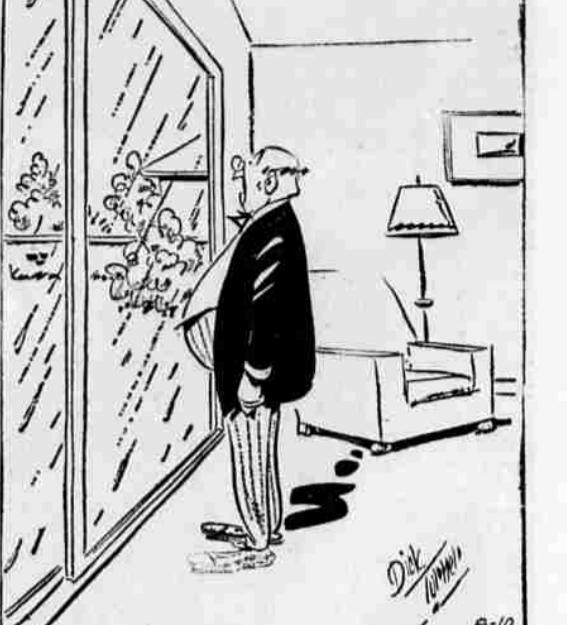
"How about asking the Smiths over for bridge, Ethel? They're water enthusiasts!"

LOST? Classified Ad INDEX To Buy...Sell...Trade