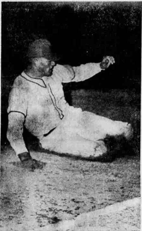
GET UP AND GO! —Typical of action at Redmond last night between the Redmond and Prineville junior baseball teams, this scene at third base. An unidentified Prineville player slides in safe to third on a steal. An overthrow on his maneuver enabled him to score Prineville's seventh run, as the Crook County boys bounced loop-leading Redmond, 10-2.