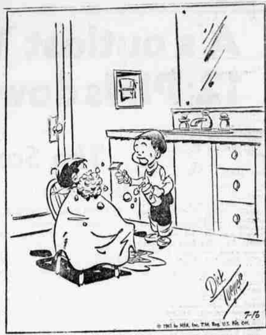
"Maybe we should make just a LITTLE noise, Alex! My mother always hears me when I'm being too quiet!"

He told the House of Commons the government has called attention to such reports and that U.N. Secretary General Thant has ordered an investigation.