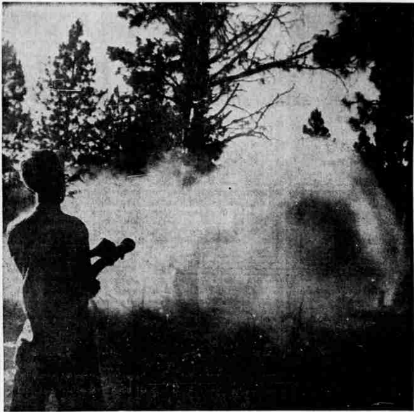
VOLUNTEER FIREMAN — Bend firemen and a number of unidentified men and youngsters fought a brush fire that covered more than an acre near Cleveland Ave. on the south side of Bend Sunday afternoon. An unidentified man is shown with a fire hose.

DARRELL'S HOUSE OF MUSIC 1001 Wall 382-1745