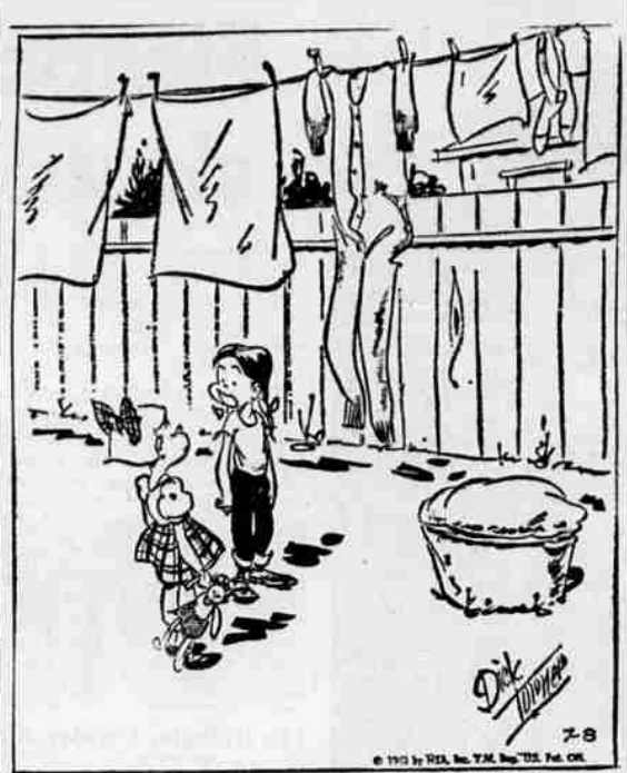
"Those? Those are grandpa's leotards!"