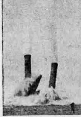
THAT THEY BLOW—Looking like the stacks of some ancient battlewagon sinking beneath the waves, twin smokestacks crumble into rubble in Hamilton, Ontario, Canada, as 100 pounds of explosives are set off at their bases. The 275-foot smokestacks, part of a now dismantled power plant, had served as landmarks on the edge of Hamilton Bay for nearly half a century. These photos were clipped from movie film taken by Ontario Hydro News.