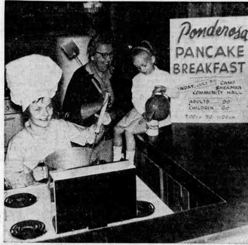
PANCAKE FLIPPERS—It takes all kinds to make a world — and a successful pancake feed, so say Camp Sherman Community Clubbers. They have enlisted the aid of all ages and sizes to prepare for the Ponderosa Pancake Breakfast, to be held July 7 from 7 until 11 a.m. in the Camp Sherman Community Hall.