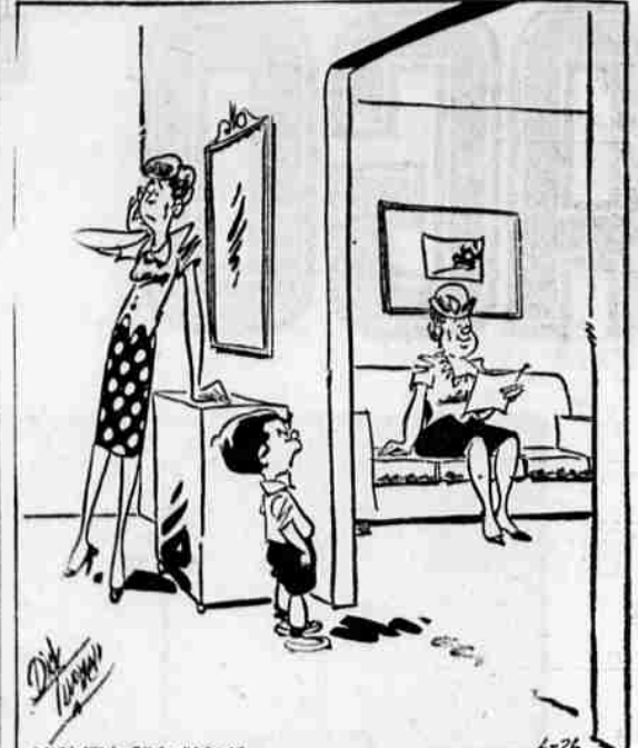
"Well, you said find something to interest her and that stack of unpaid bills in your desk seems to be just the ticket!"