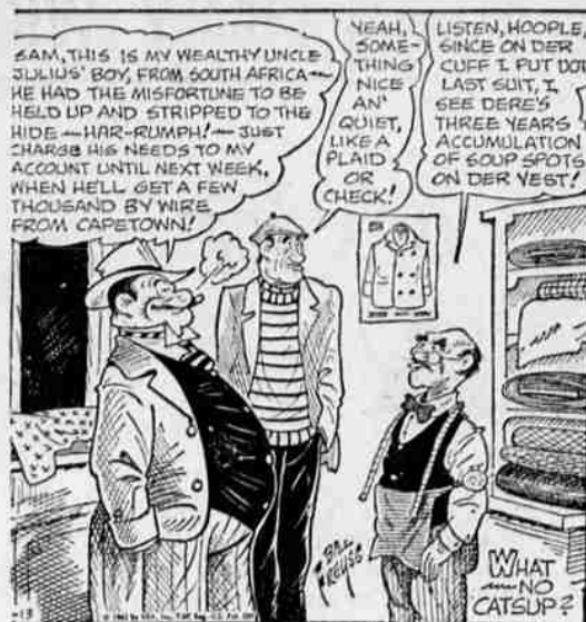
WHAT NO CATSUP?