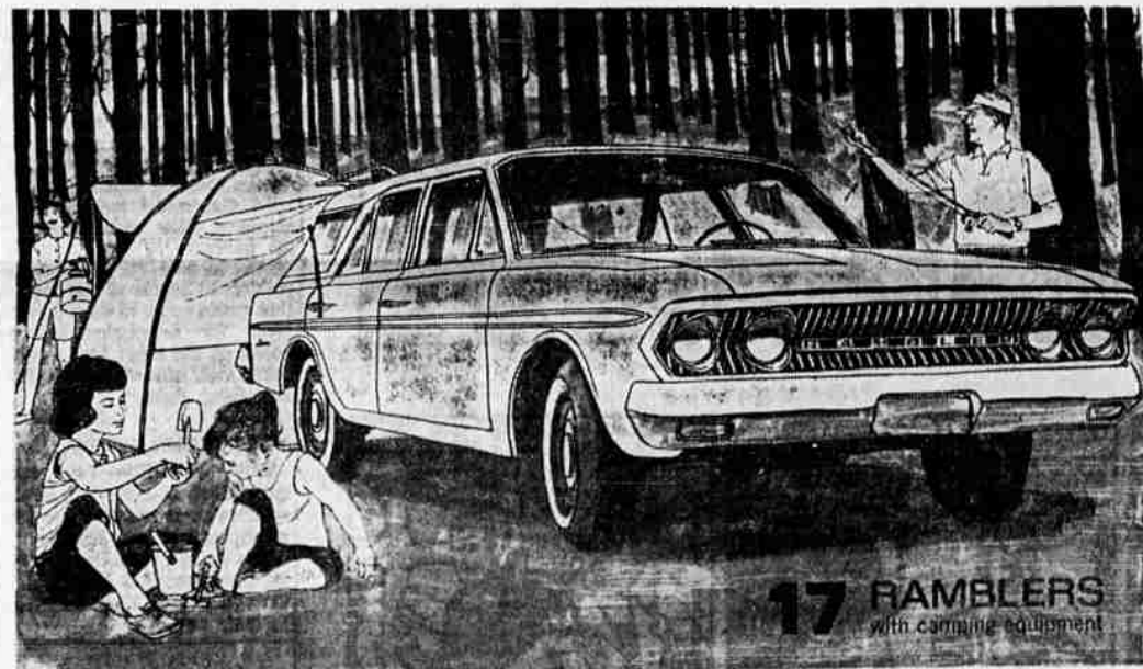
17 RAMBLERS with camping equipment