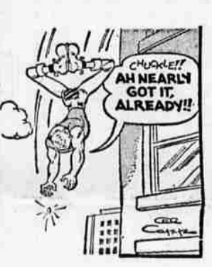
REX MORGAN, M.D.