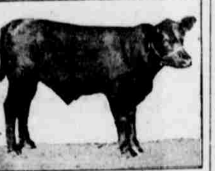
The Kind of Bull Calves Country Bankers Like, Because They Find That Live Stock Betterment Through the Use of Better Sires Means Better Live Stock and Better Business Generally.

The department of agriculture is ready to enroll in the campaign any live stock owner who fills out the pre-