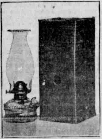
A Home-Made Egg Candling Outfit.

It is necessary to rotate an egg before the candle if one is to obtain an accurate knowledge of its condition. By tilting at various angles, the location and size of the air space can be seen, and very often the position of the yolk. But the quality of the egg is very largely determined by the ease