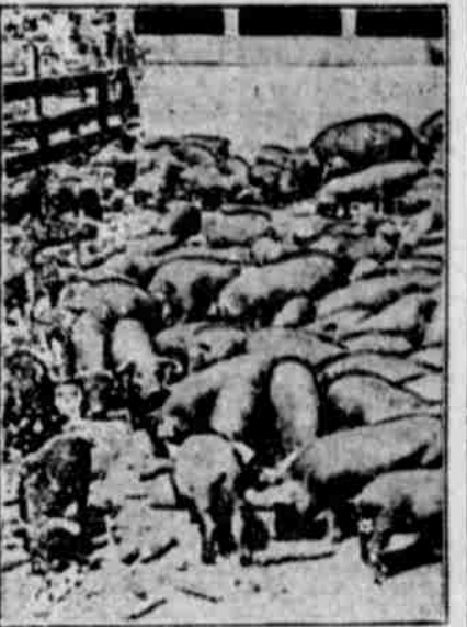
Do Not Neglect Hogs After Vaccination Against Cholera.

"For the first two weeks, if it is in season, allow shipped hogs limited