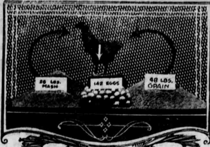
At Uncle Sam's experimental farm in Maryland, across the Potomac from Washington, D. C., the Department of Agriculture develops many helpful, progressive and profitable new methods for the producers of the nation. This photo shows the consumption and production in one year from one of the hens in a feeding test there.