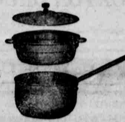
1-Qt. DOUBLE BOILER

Given with $25.00 in Trade and $8.30 in Cash.