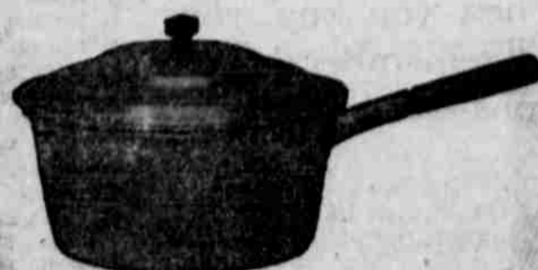
SPECIAL WINDSOR SAUCE PAN