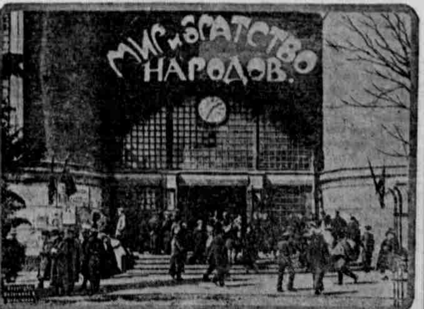
Entrance to one of the big halls in Moscow where the anarchists hold their meetings. The inscription over the doors is "Peace and Brotherhood of the People."