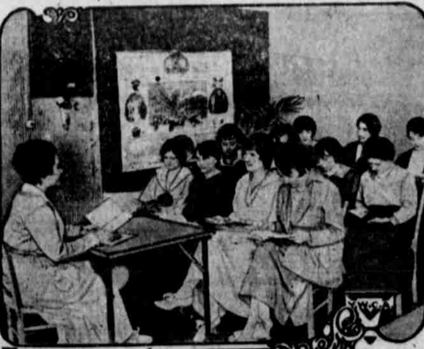
FRENCH FACTORY GIRLS LEARNING ENGLISH IN A CLASS, CONDUCTED BY THE Y.W.C.A.