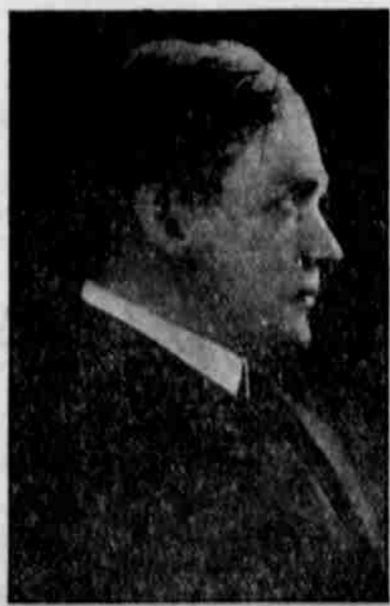
Whose lead over West has reached almost 10,000.