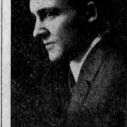
Representative from Twenty-first district.