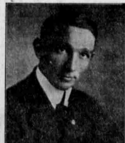
Who succeeds himself.