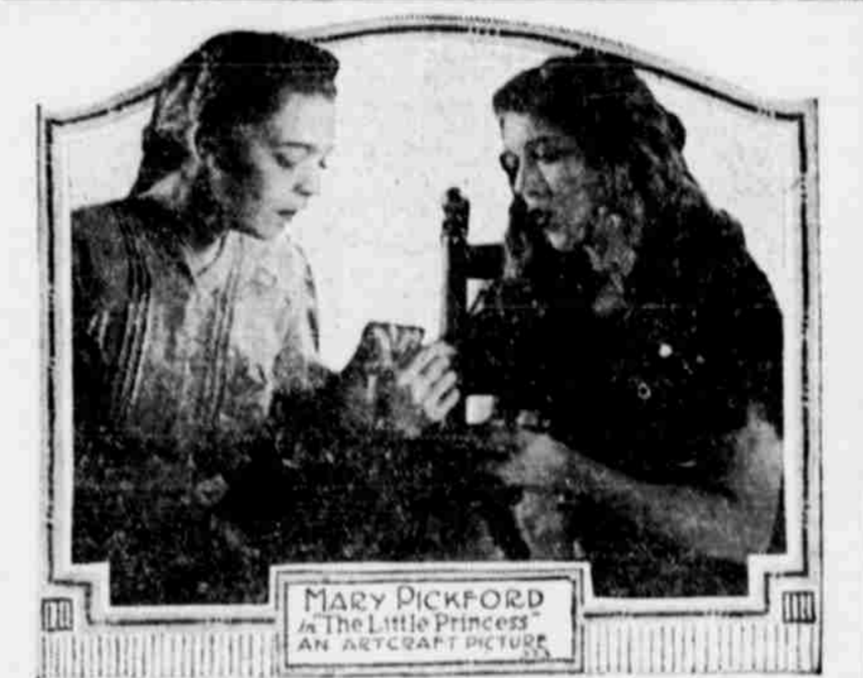
MARY PICKFORD in "The Little Princess" AN ARTCRAFT PICTURE

At the Liberty Theatre, Sunday and Monday.