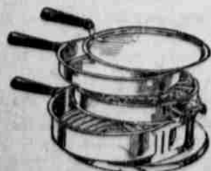
An Electric Grill Toasts, Boils, Fries; Only $7.50. The Power Co.

See J. Ryan & Co., for farm land loans.—Adv.