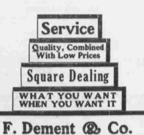
Opposite P. O. GROCERIES Wall Street

PHOTO-ENGRAVING WRITE FOR FREE CATALOG AMERICAN COLLEGE OF PHOTO-ENGRAVING