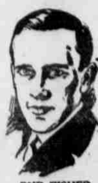
BUD FISHER Famous Cartoonist, says: "Tuxedo has made a pipe my favorite form of smoking. Its coolness and mildness make pipe-smoking a real pleasure." Bend Fisher

Bud Fisher jumped the old-time rut when he invented Jeff and Mutt. For years, with that amusing pair, he's chased away the people's care, and made them laugh and throw their hats, and cackle till they broke their slats. The tired, the sad, the weak, the worn, have laughed with Bud, and ceased to mourn; the lame, the halt, the blind, the deaf, have whooped with glee o'er Mutt and Jeff. Where does he find the joyous jests which break the buttons from our vests? You'd think the fount would have to fail, but never once has he been stale. When he sits down to hatch a plot in which his heroes will be caught, he lights his pipe, and soon a joke emerges from Tuxedo smoke. He swears by "Tux" and so will you, when you have tried a jar or two.