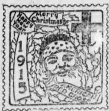
The 1915 Seal.

seals are used by the associations in various ways to assist in the fight against tuberculosis and many thousands of dollars are received yearly from this source. All the association officers are unpaid. In Bend the stamps are on sale at both drug stores and the post office. In addition school children are selling them.