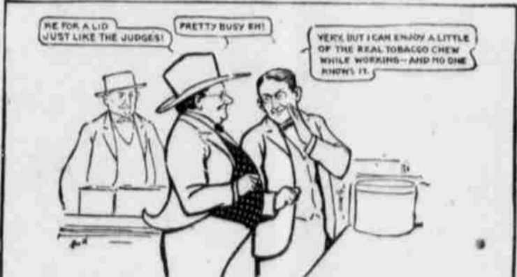
THE MATTER TELLS THE GOOD JUDGE ONE REASON WHY IT IS BETTER.

WHEN a fellow wants tobacco satisfaction and finds how he can get it, it's natural for him to put the other fellows next to the Real Tobacco Chew , because a little chew satisfies. Tobacco satisfaction is what he is looking for—the smaller the chew it takes, the better it suits him. A little chew of pure, rich, mellow tobacco—seasoned and sweetened just enough—cuts out so much of the grinding and spitting.