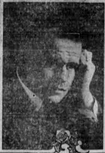
Here is a lecturer who has fired the soul of many audiences. He is called "The Little Giant." He is virile and fascinating. Hear him without fail.