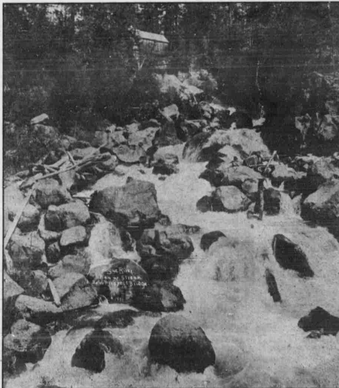
One of the Beauties of the Western Hills

A thousand mountain streams in the Northwest furnish ten thousand enchanting scenes at their headwaters. Starting from beneath the snows of some lofty mountains or springing unheralded from the mosses of a green hill, these streams tumble and roar over rocks in their mad haste to reach the sea. Now foaming with impatience, now flowing clear and cold, they hasten downward to join others bent on the same restless mis-