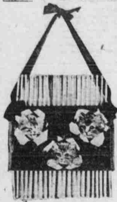
THE SCRATCH MY BACK.

The edges are passe-partouted together, and a narrow ribbon makes the