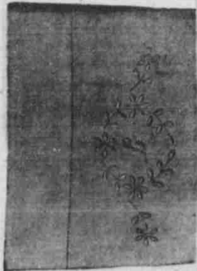
AN EMBROIDERED PILLOW SLIP.

An alarm clock is rarely given, and if a handsome variety is given it makes a nice gift. Choose a face with large