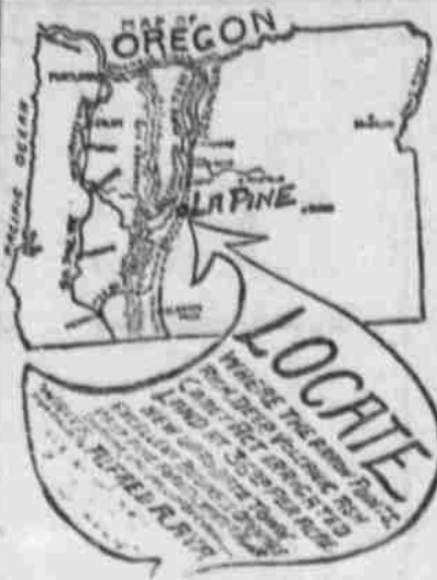
LA PINE, CROOK COUNTY, ORE.