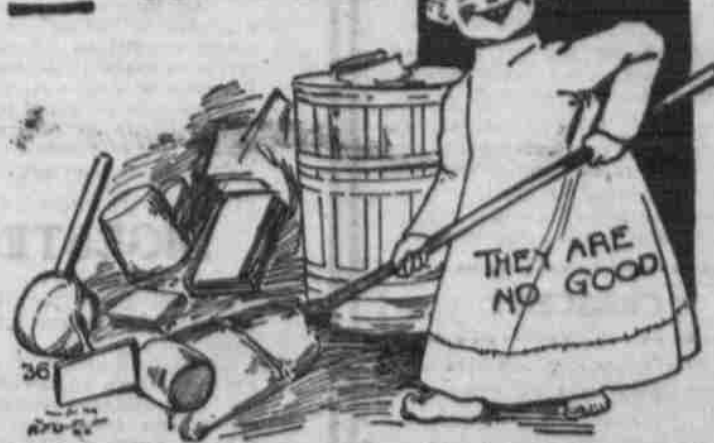
FIGURE ON THE FREIGHT BEFORE YOU SEND OFF TO THE MAIL-ORDER HOUSE FOR HARDWARE. IT IS HEAVY AND THE FREIGHT WILL COST LIKE ALL-FIRE.

NEVER AGAIN! NO MORE MAIL ORDER GOODS COME INTO MY HOUSE