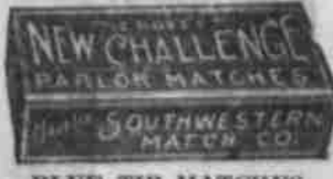
BLUE TIP MATCHES Per Box 3c.