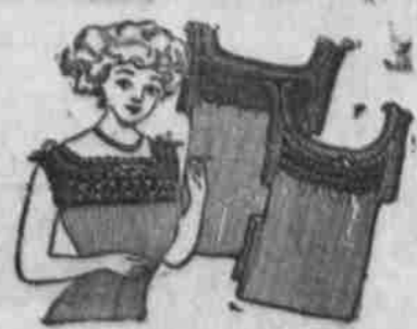
LADIES' VESTS 10c, 12c, 15c, 20c and 25c.