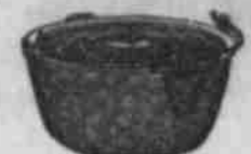
4-Qt. and 6-Qt. Enamel Preserve Kettles, 14c and 17c.