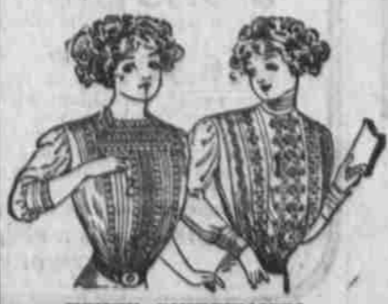
WHITE SHIRTWAISTS 60c, 75c and $1.25.