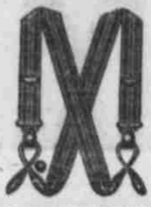
ALL 50c SUSPENDERS Now 38c.