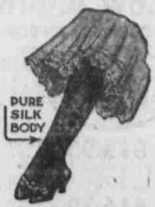
LADIES' FINE SILK HOSE 48c and 75c. 80c Burson Hose Now 20c.