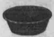
2-QT. ENAMEL PUDDING PAN, 2 for 25c.