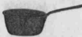
ENAMEL STEW PANS 20c to 40c.