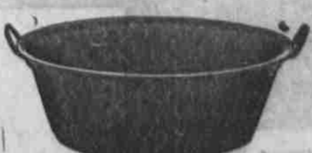
17-Qt. Enamel Dishpan Only 38c.